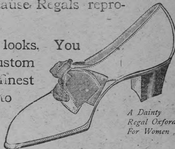
A Dainty Regal Oxford For Women