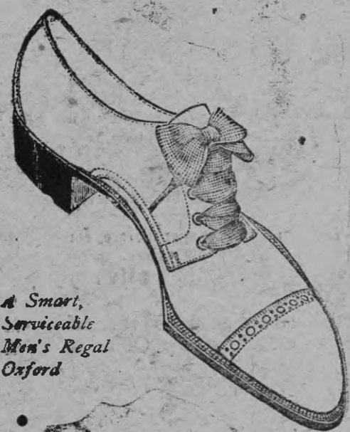
A Smart, Serviceable Men's Regal Oxford